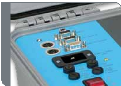
Inputs/outputs for manual or automatic settings.