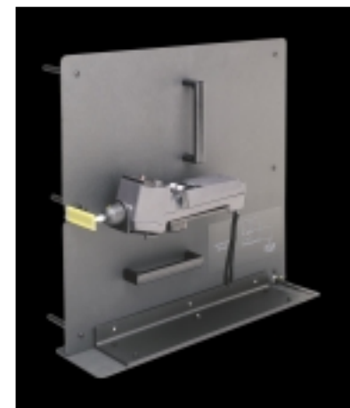
Vertical Coupling Plane Model VCP-1, being used to test a PC. The MiniZap is positioned to inject current via IEC Contact Mode Omni-Tip™ Model TPC-2A into the center of a VCP vertical edge, per the requirements of the various standards.

Contact mode testing is used to insure repeatable, fast-risetime, ESD current waveforms into the edge of the VCP.