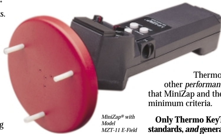
MiniZap® with Model MZT-11 E-Field Simulation Tip.

By simply interchanging plug-in tips, the MiniZap allows you to meet both the standard's 0.7 to 1.0 ns risetime, and to do "reality" – generating the real, <200 ps ESD risetime, to see how well your products will really survive in their intended environment.