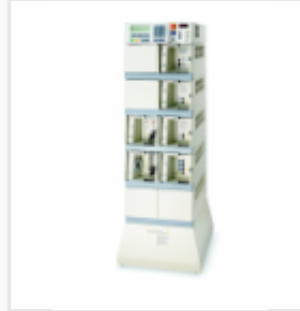
ECAT EMC Test System