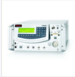
EMCPro Plus™ EMC Test System