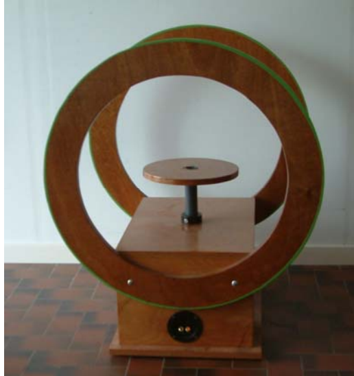
Andamento Induzione Magnetica (B)