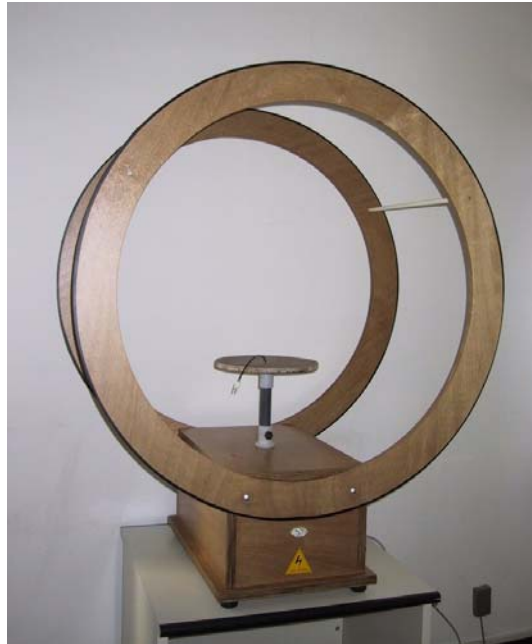
Andamento Induzione Magnetica (B)